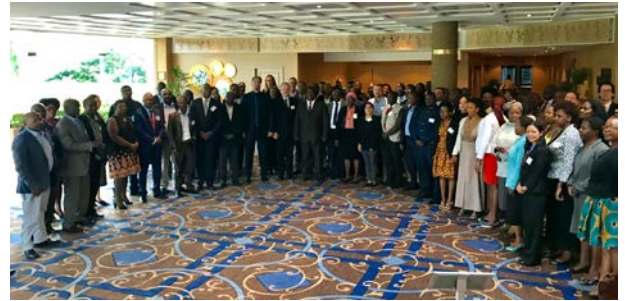
Participants at the Swaziland ECW

The GEF Expanded Constituency Workshop (ECW) for the Southern Africa Constituency took place in Swaziland from 21 to 24 February 2017. Over 90 participants, including GEF and Convention focal points, representatives from Civil Society Organizations, GEF Staff and GEF Agency colleagues from FAO, UNDP UNEP, IFAD, IUCN, WB and WWF as well as a representative from the UNFCCC Secretariat participated in the four-day workshop. ( Agenda | Participants )