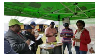
Participants learn and exchange ideas during the GEF Knowledge Day